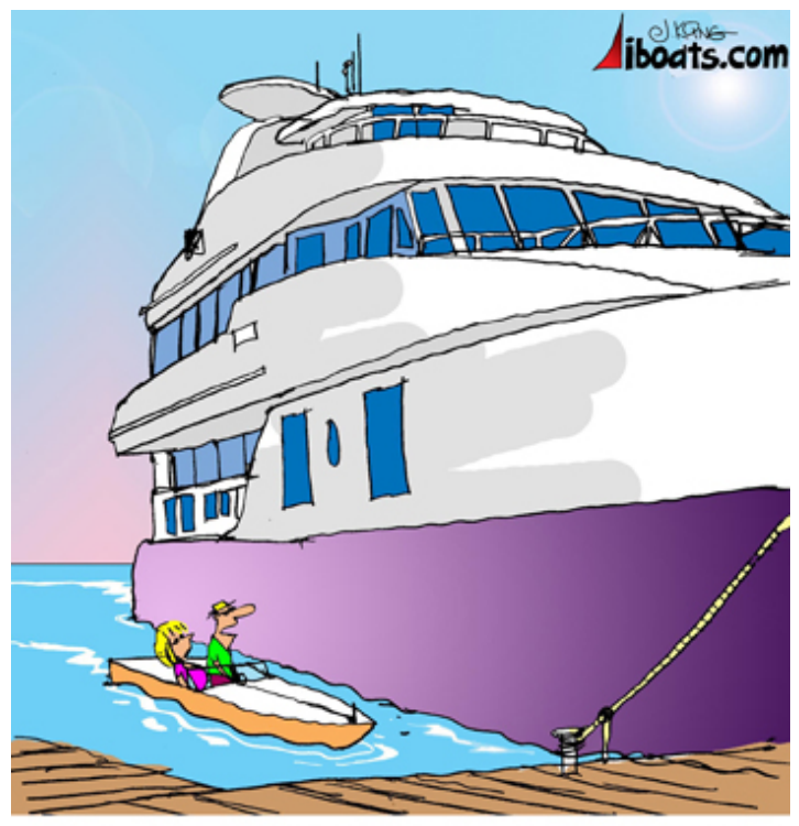
"I'm glad they're expanding the harbor. Because I just know one of those superyachts will park too close and scratch my boat."